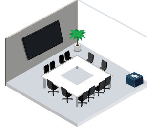
SPARK ROOM Small Boardroom/Classroom