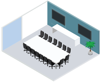
IGNITE ROOM Large Boardroom/Classroom

30 Accredited Businesses or Nonprofits used the Community Center rooms in 2019-2020 for more than 370 attendees.